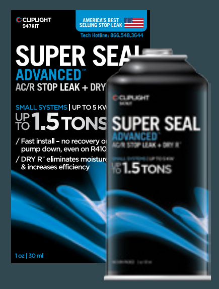
947KIT* SMALL SYSTEMS UP TO 1.5 TONS I 5 KW