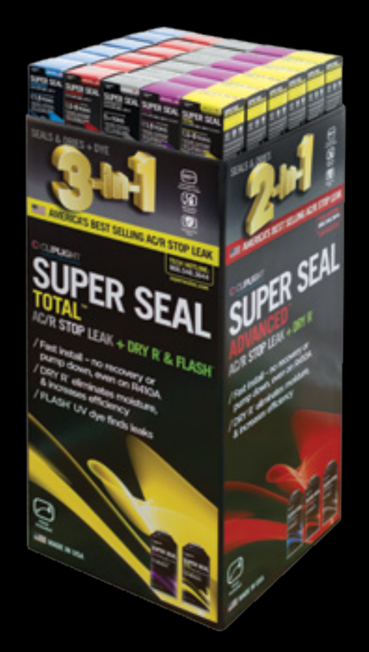
30 PACK FLOOR DISPLAY 17" Wide • 36" High • 17" Deep MKT - MERCH - SEAL30

MERCHANDISER DISPLAY 8" Wide • 11" High • 6" Deep MKT - MERCH - FLEX