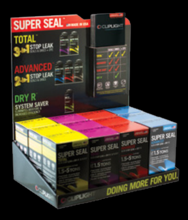
12 PACK COUNTER DISPLAY WITH PRODUCT BROCHURES 14" Wide • 16" High • 9" Deep MKT - MERCH - SEAL12