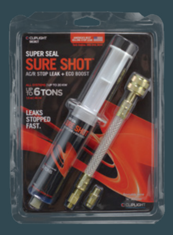
983KIT* KIT WITH HOSE ALL SYSTEMS UP TO 6 TONS