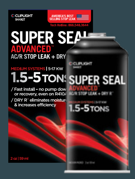
344KIT* MEDIUM SYSTEMS 1.5-5 TONS | 5-17 KW