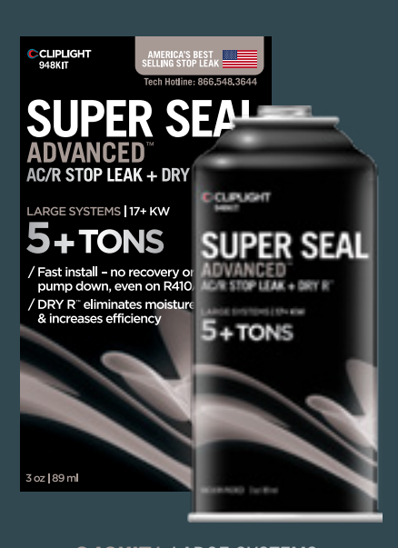
948KIT* LARGE SYSTEMS 5+ TONS | 17+ KW

Reduce callbacks & prevent refrigerant loss with the industry's most trusted AC/R stop leak.