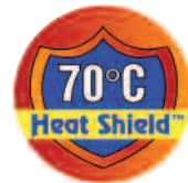
* Heat Shield