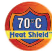
* Heat Shield

GE up/down outdoor condenser fan motors are designed for either vertical shaft-up or shaft-down applications. Shell and end shields are enclosed for weather protection. A weep hole is provided in each end shield to allow condensate to drain. A plastic plug is provided to seal the weep hole in the end shield exposed to the weather. All of these motors are suitable for air conditioning or heat pump applications. All feature reversible rotation, 208-230 volts, six inch shaft length and extended thru bolts extending from both ends.