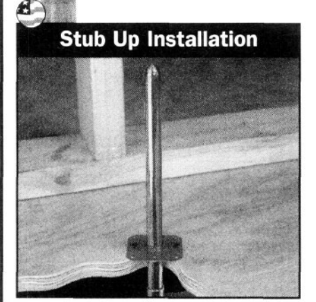
Stub Out with Eared Strap