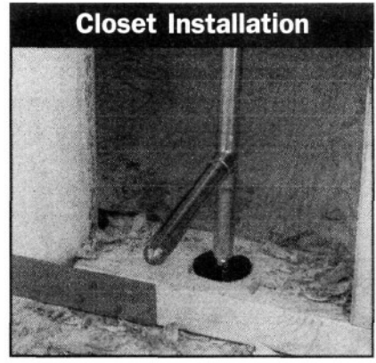
Straight Stub Out