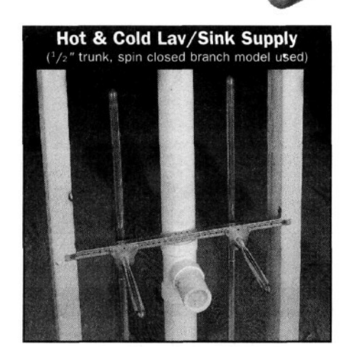
Test-ready stub outs and air chambers, with only ONE solder joint needed.