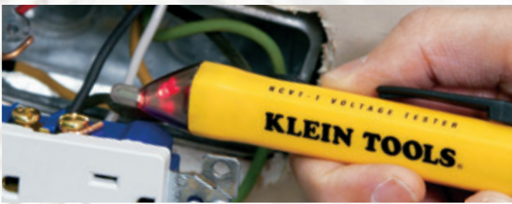
The NCVT-1 detects standard voltage (48-1000V AC) in cables, cords, circuit breakers, lighting fixtures, switches, outlets and wires.