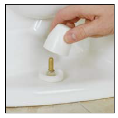
Base is installed between the bowl and nut.