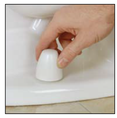
Cap screws onto base for a secure connection.