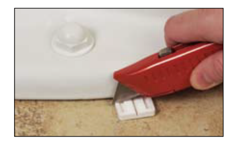
Ideal for leveling unsteady closet bowls.

For more information on these toilet specialties see our catalog.