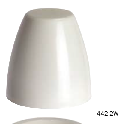
• Taller cap eliminates the need to cut brass bolts