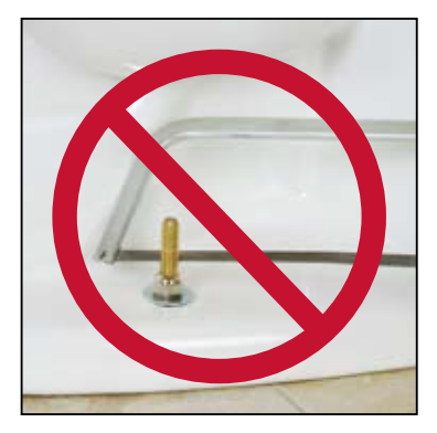
Never cut brass bolts again. Bolts that are cut may become too short to reuse if additional flooring is added.