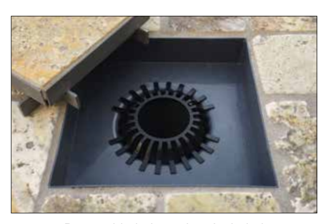
Removable hair strainer included with ABS head models