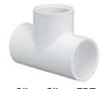
Slip x Slip x FPT