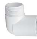
MPT x FPT