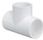
Slip x Slip x Slip

KEY: FPT.....Female Pipe Thread SLIP.....Solvent Cement Socket MPT.....Male Pipe Thread SP.....Spigot