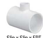
Slip x Slip x FPT