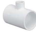
Slip x Slip x Slip