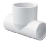
Slip x Slip x Slip