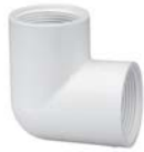
FPT x FPT

KEY: FPT.....Female Pipe Thread SLIP.....Solvent Cement Socket MPT.....Male Pipe Thread SP.....Spigot