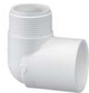
MPT x Slip