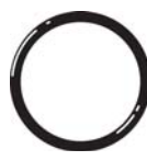
Buna-N (Nitrile) (Current style)

Pressure rated at 150 p.s.i. at 73.4°F. Unions are listed as NSF 61