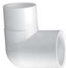
SP x Slip