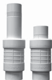
Slip x Spigot