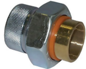
Pictured T-571NL (1/2" - 2")