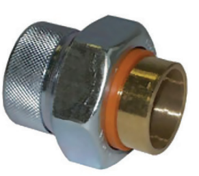
Pictured T-571NL (1/2" - 2")